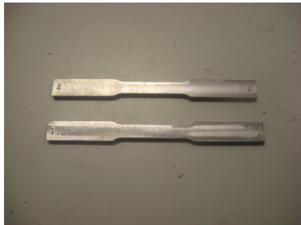
Machined Test Specimens obtained from steel samples No.s 1 and 2.