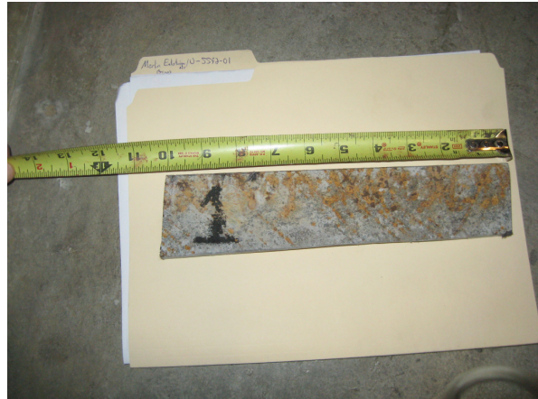
Steel Sample No. 1.

The results of chemical and tensile testing indicated sampled steel at both locations met the Chemical and Tensile Requirements of ASTM A36-08. The steel test specimens did not meet the requirements of ASTM A 572-07 (grade 50). The engineer of record used this information to determine the as built allowable loads for the subject level.